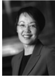
Cantor Angela Buchdahl