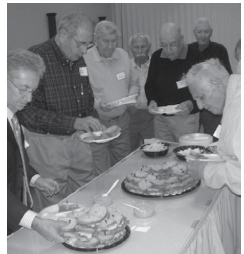
Lunch at 'Lunch with Rabbi' Series

As in real life, the group came close but was unable to suggest a